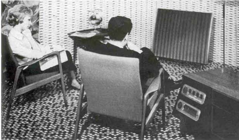
The Hi-Fi World listening panel...

hearing it in a Tokyo nightclub, back in 1992! Sheer, unabashed transparency – with no quacks, warbles, sponginess, squeaks, squawks, booms or tizzes. This is why people love electrostatics – it takes you to a higher plane. You feel privy to a secret that even most audiophiles don't know. It's an amazing sensation of sheer luxury and indulgence, yet it seems so natural and so right. You think to yourself, 'why did I bother with anything else for so long?'